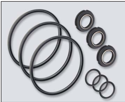
KIT 2: Casing Gaskets, Carbons, O-Rings