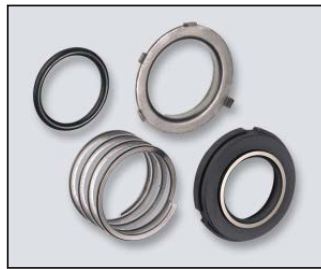
KIT 3: O-Ring, Cup, Spring, Carbon