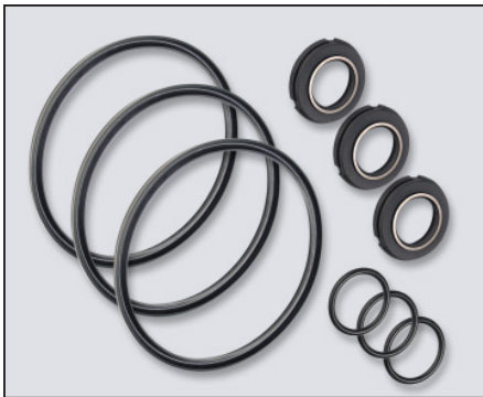
KIT 2: Casing Gaskets, Carbons, O-Rings