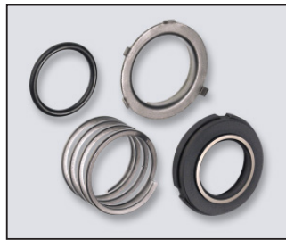
KIT 3: O-Ring, Cup, Spring, Carbon