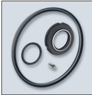
KIT 1: O-Ring, Carbon, Impeller Pin, Casing Gasket